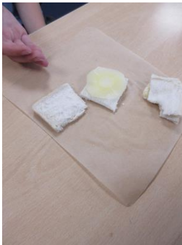
7 - Making a WW2 style parsnip sandwich.

Earlier this week, the children enjoyed the grand finale of their WW2 topic with a food tasting session. It was based around foods that were available during the war such as having parsnip sandwiches and comparing them to banana sandwiches which were not available. It was a good opportunity to talk about food miles and where some of our foods come from. In English, we have just finished our Philip Pullman novel, during which, the children wrote some super character descriptions. The children are looking forward to their Crucial Crew trip to Bridgnorth next week on Thursday 23rd June. Crucial Crew is a safety training and awareness course for children in Year 6.