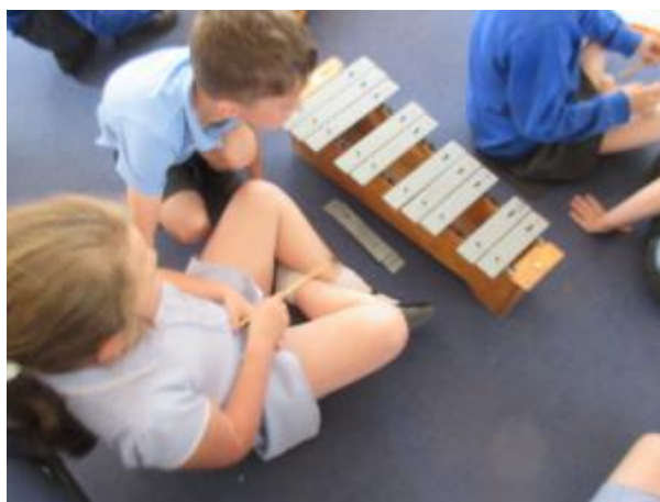
1 - Composing music.

Thank you for your continued support and have a lovely weekend.