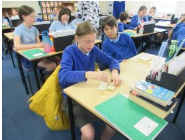
8 - Some liked it...