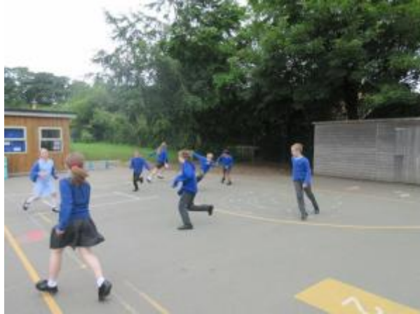
6 - Children representing particles of a gas.