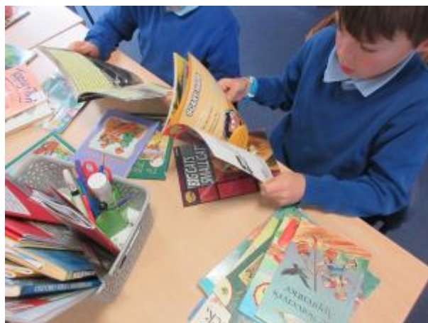
3 - Exploring non-fiction books and comparing them to fiction.

https://www.youtube-nocookie.com/embed/26JzP5sl61Y?playlist=26JzP5sl61Y&autoplay=1&iv_load_policy=3&loop=1&modestbranding=1&start=