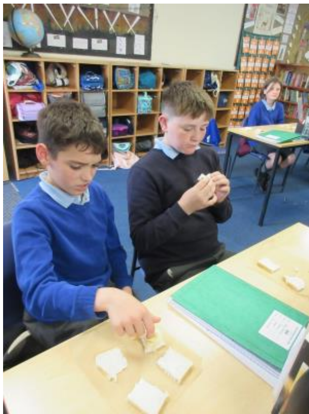
9 - ...some didn't!