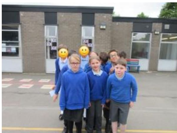
4 - Children representing particles of a solid.

Welcome back! The children have had a busy fortnight with starting lots of new topics. In maths, we have started learning about time. The children consolidated work from last year, revising telling to the time to the minute using analogue clocks, looking at AM and PM as well as a reminder of the 24hr clock. This past week, we have looked a lot at telling and writing the time digitally. In reading, we have focused some of our lessons on 'Street Child' by Berlie Doherty. We have been making inferences about a character and their personality. In PE, this term we are having dance with GKY Dance. The children have demonstrated some of the fantastic skills they have been taught throughout the year and have really gained their confidence in showcasing them. In science, we have been finishing up our unit on 'States of Matter'. The children have learned how particles differ depending on the materials. Look at our photos of how we represented them.