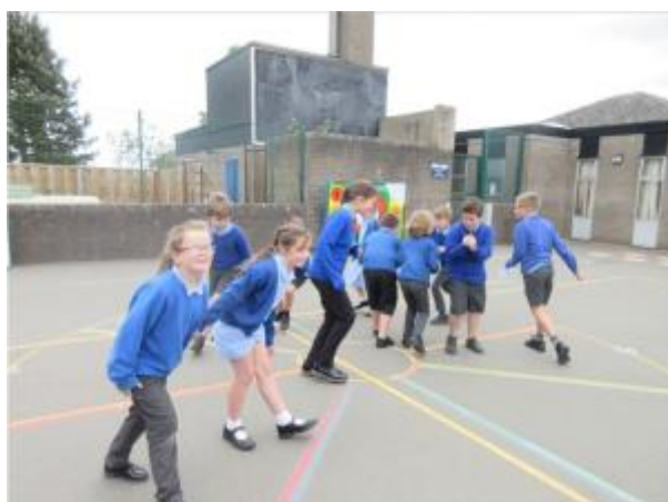
5 - Children representing particles of a liquid.