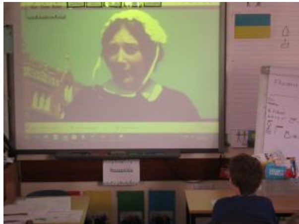
2 - Listening to an interview with Florence Nightingale.

https://www.youtube-nocookie.com/embed/26JzP5sl61Y?playlist=26JzP5sl61Y&autoplay=1&iv_load_policy=3&loop=1&modestbranding=1&start=