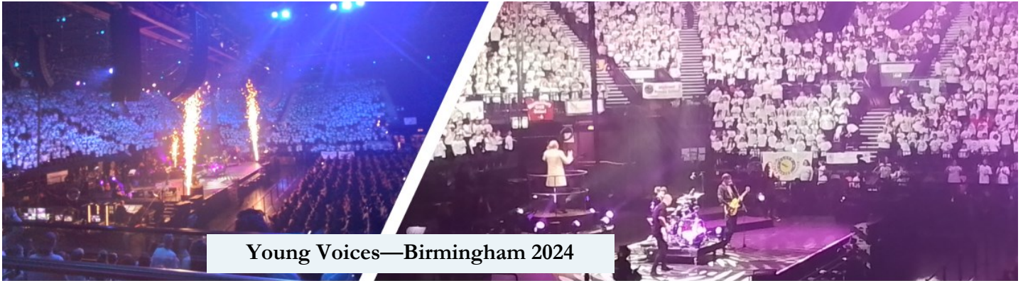
Young Voices—Birmingham 2024