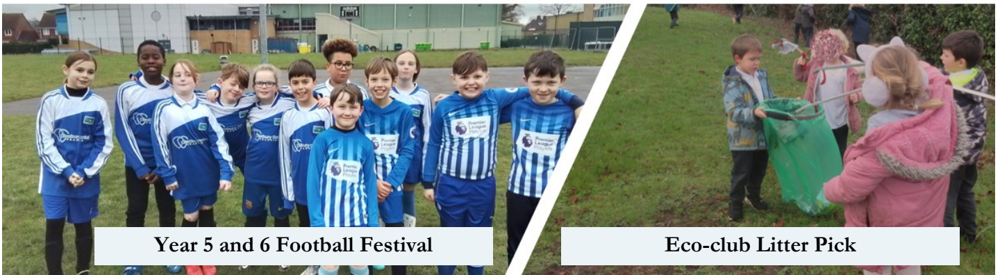
Year 5 and 6 Football Festival