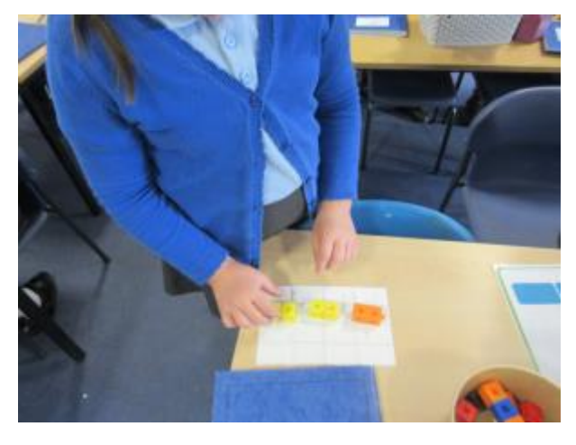
2 - Checking that I have made a model using thirds