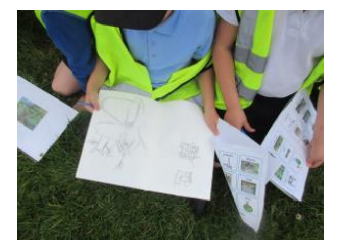
5 - Sketching the fountain.

4 - The amazing fountain at Witley Court.