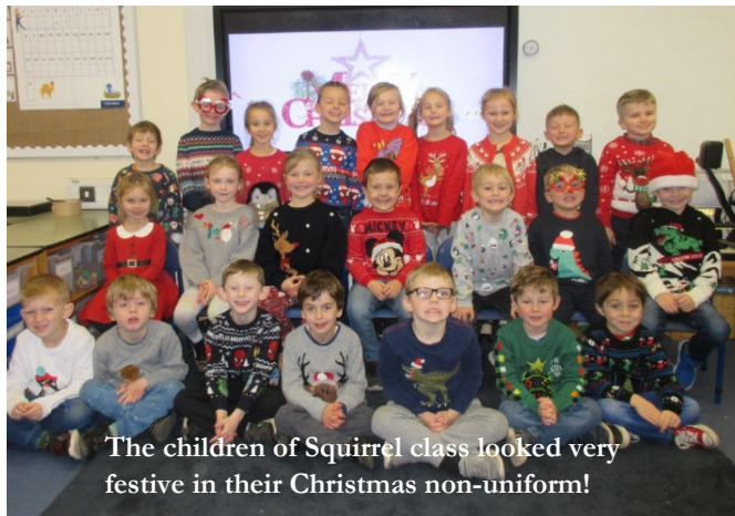
The children of Squirrel class looked very festive in their Christmas non-uniform!