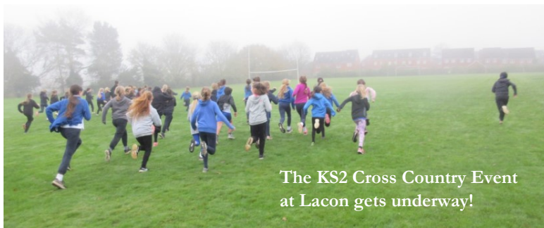
The KS2 Cross Country Event at Lacon gets underway!