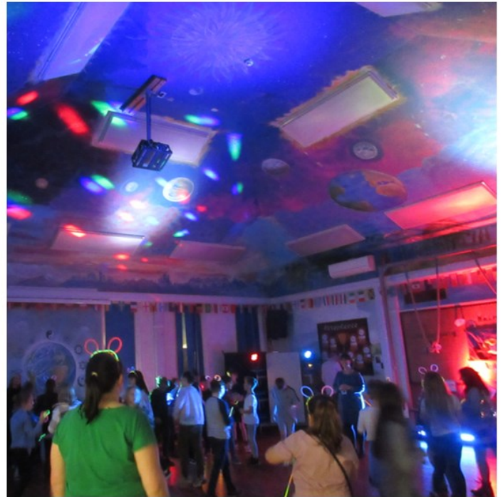
Spring School Disco