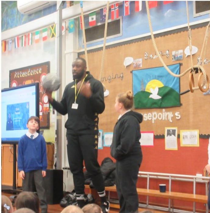
Sponsored Athlete Visit